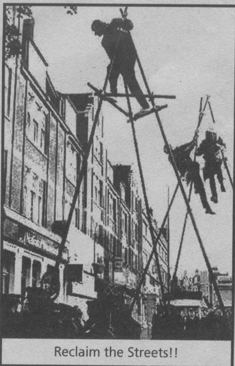
Reclaim the Streets!!