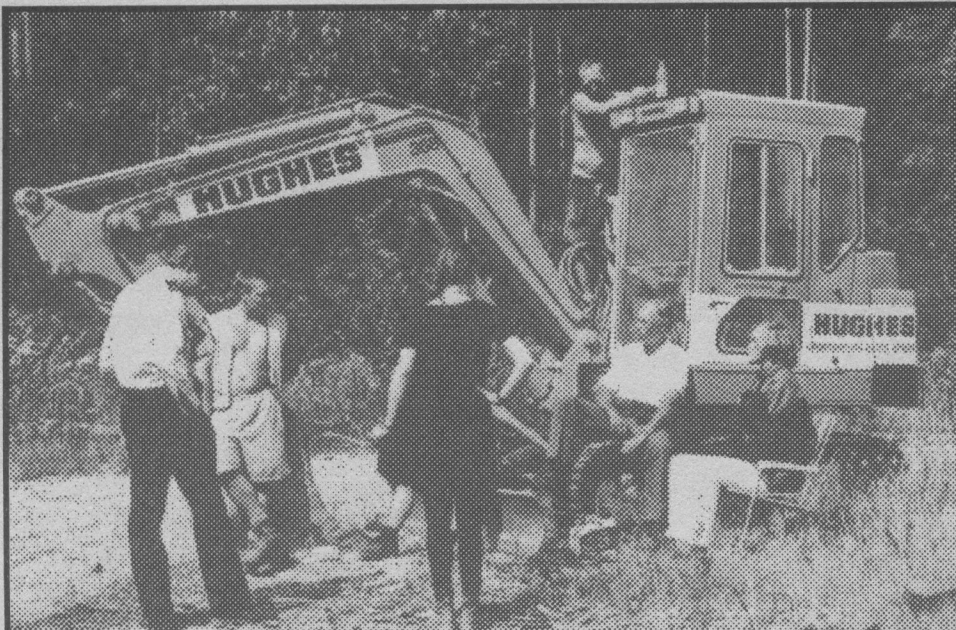
Things to do in Newbury on a sunny afternoon ...

with impaired mobility. There will also be a crèche. To get there by road: Hornby is on the A683, 8 miles from Lancaster and M6. Wray is on the B6480 from Bentham, 1.5 miles from Hornby. From Hornby or Wray, take the road signed to Roeburndale West. About 1.5 miles up the hill you will cross a cattle grid. Take the first track down on the left, signed MIDDLEWOOD. By bus: Ribble buses 80, 81 and Kirkby Lonsdale 278 run regularly from Lancaster to Hornby/Wray until 11 p.m. Please arrive from Friday afternoon. There will be pick ups from Lancaster and Hornby at 8 p.m. and 10 p.m. on the Friday and Saturday. A mobile phone will be available from Friday 22, Tel : 0378 336006, there are no promises of reception due to the landscape! For further information before the weekend call: 0151 733 2073. See you there!