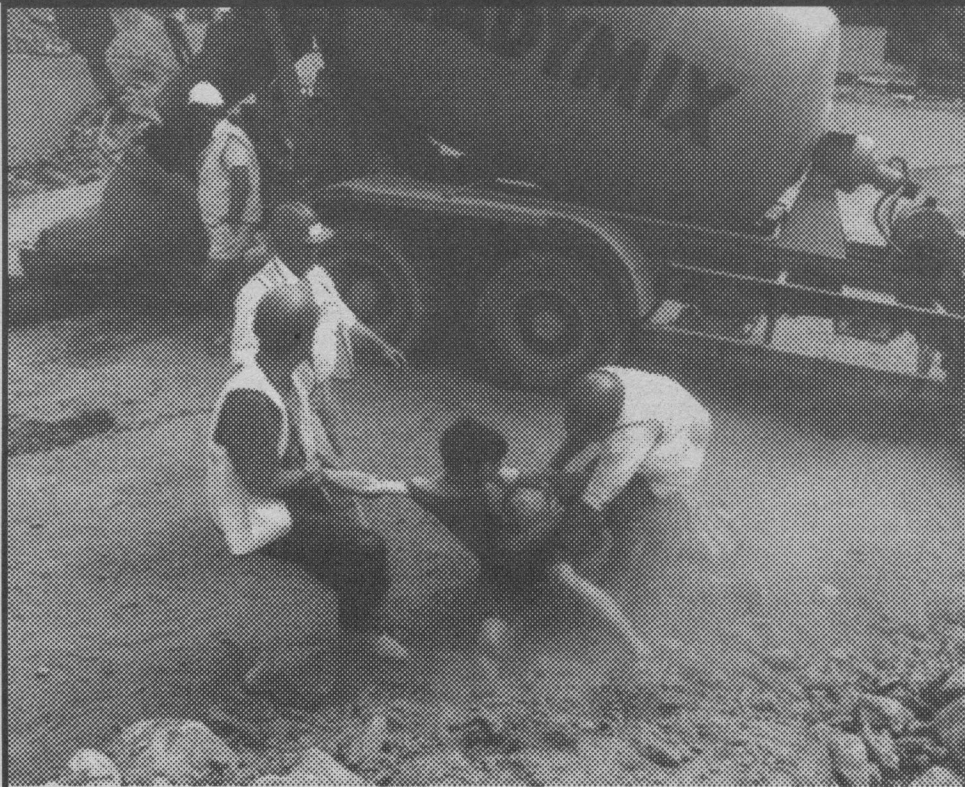
Life's a drag at Solsbury Hill!

Protesters against the M66 (North of Manchester) through Medlock Valley have been camping at Daisey Nook Country Park since July. A new camp and squat have recently been opened up and the first tree house