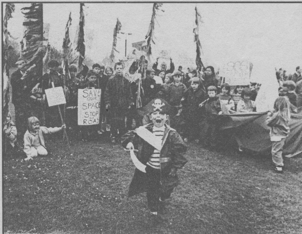
The Kids in Wells say NO to the road

On Monday 10 July, after 7 peaceful weeks at Selar Farm Nature Reserve- proposed opencast site near Neath, South Wales- Celtic Energy moved in to "translocate" the last of the protected watermeadows. It had been costing them £400 an hour to keep the contractors (Alaska Environmental Services) on site doing nothing. So, they decided to finish the job in one fell swoop with the help of their own private security firm- the South Wales Constabulary. Celtic and Alaska in their "high regard for the environment" bulldozed their way through hedges and lopped huge branches off oaks in order to get into the watermeadows. The police were in total collusion and behaved like moronic thugs. Benders were pulled down and their occupants bundled into police vans, walkways were cut with people on them and arrests were made for, amongst other things, swearing at a lorry and rolling a fag. One road access bridge was pickaxed and a Group Four car was trashed, oh dear!! Things are quieter at Selar now. A permaculture garden and compost loos are being constructed. There is no